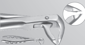
Lower Anterior Forceps-Notched 3600