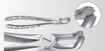
Lower 3rd Molar Forceps 7900