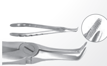
Lower Narrow Root Fragment 4507