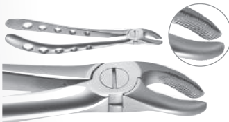
Upper Molar Left Forceps 1700