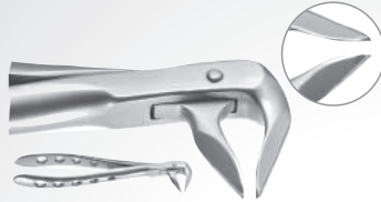
Lower Anterior Forceps 3608