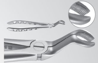
Upper 3rd Molar Forceps 6701