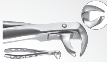
Lower Molar Forceps 7301