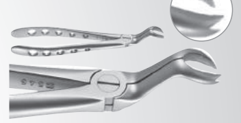
3-Prong Upper Right Molar Forceps 6718