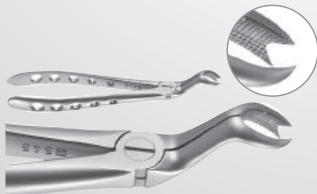
3-Prong Upper Left Molar Forceps 6717