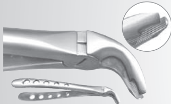
Lower Universal Forceps-Notched 2190