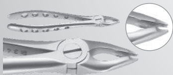
Upper Anterior Forceps-Notched 3400