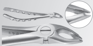
Upper Universal Forceps-Notched 3500