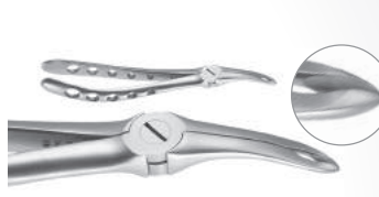
Universal Maxillary Root Forceps 4415