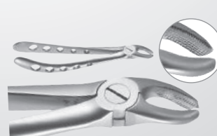
Upper Molar Right Forceps 1800