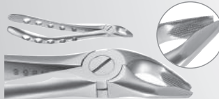
Upper Universal Forceps 3508