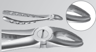
Upper Universal Forceps 0700