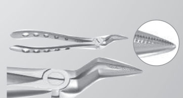
Upper Narrow Root Fragment 5197