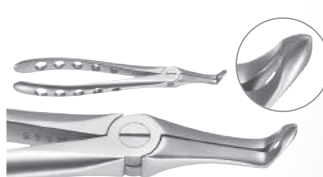
Lower Root Forceps 4515