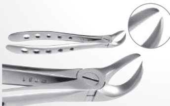
Lower Cowhorn Forceps 2300